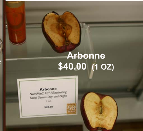
Arbonne $40.00 (1 OZ)