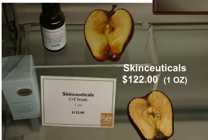
Skinceuticals $122.00 (1 OZ)

The bottom apple is the “control” or the apple that has had nothing done to it. The top apple has an application of the skin care product . These are the results after approximately 3 days.