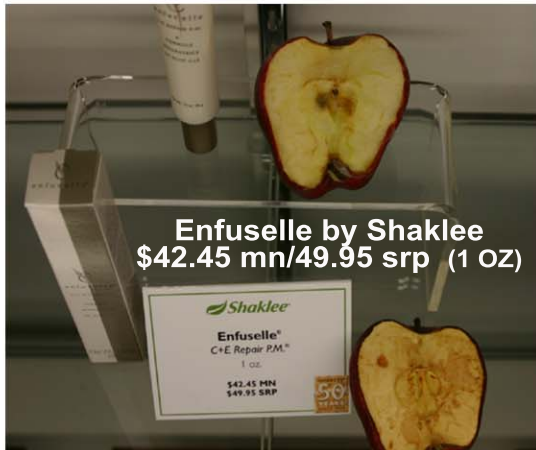
Enfuselle by Shaklee $42.45 mn/$49.95 srp (1 OZ)