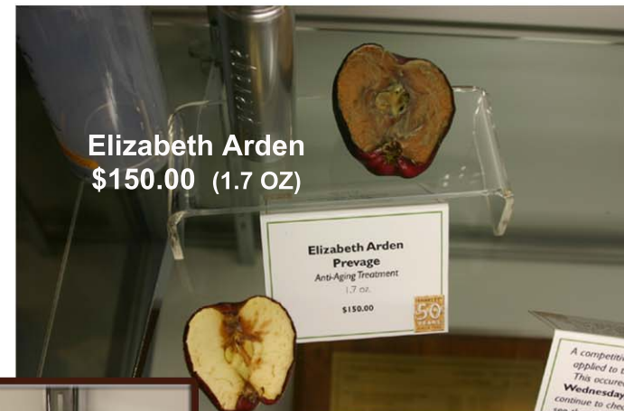
Elizabeth Arden $150.00 (1.7 OZ)