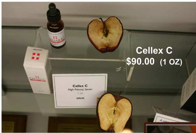
Cellex C $90.00 (1 OZ)

Compare and decide which skin care product gets real “results” and at a great price!