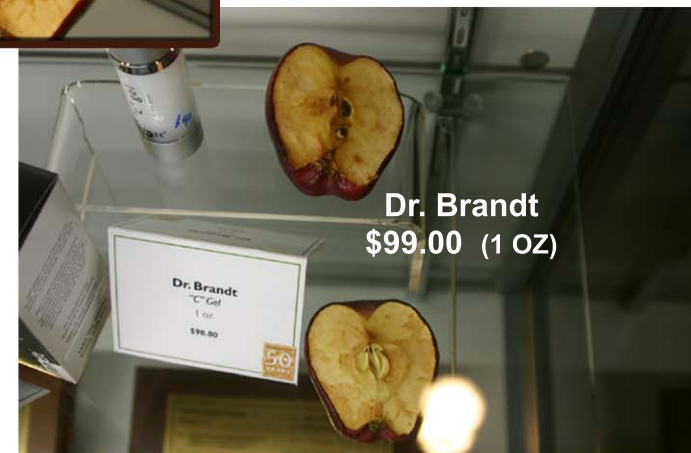
Dr. Brandt $99.00 (1 OZ)

In most of these examples you might prefer the “control” ! Shaklee’s Enfuselle being the exception!